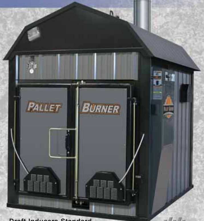
Draft Inducers Standard

Tested & Listed By O-T-L Beaverton Oregon USA C US OMNI-Test Laboratories, Inc.