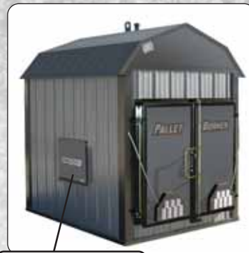
Dual Fuel Ready

Tested & Listed By O-T-L Beaverton Oregon USA C US OMNI-Test Laboratories, Inc.